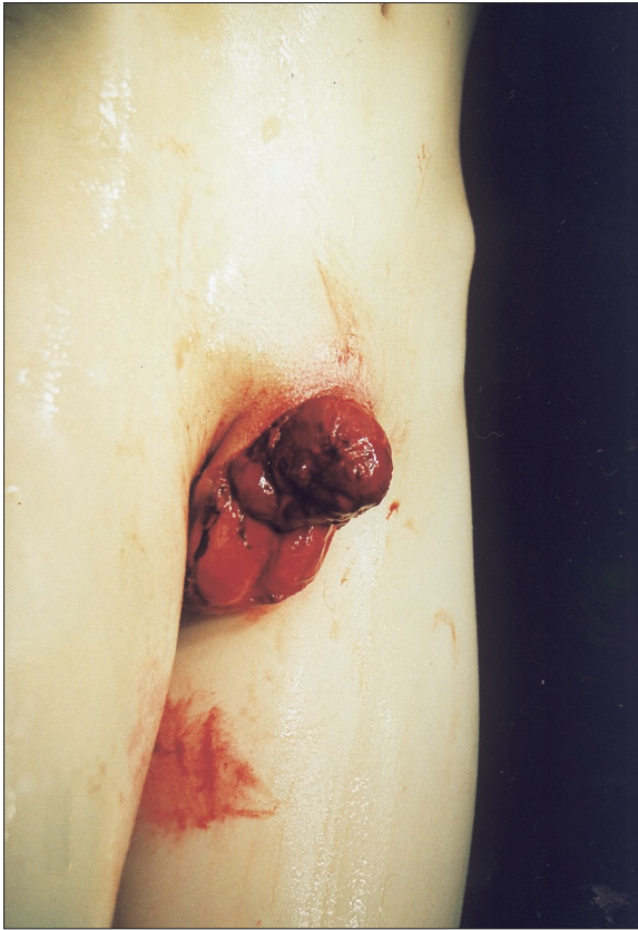
Figure 1. The jagged wound of the perineum with the penis stump covered with blood clots.

Prolene 8–0. A 2 cm loss of the deep dorsal vein made it impossible to anastomose it end to end. In order to create continuity of the vessel, a Y-shaped section of vein was taken from the patient's foot. Its lateral branch was anastomosed end to end with preprepared and relocated to the subcutaneous canal of inferior epigastric artery using Prolene 10–0 single stitches.