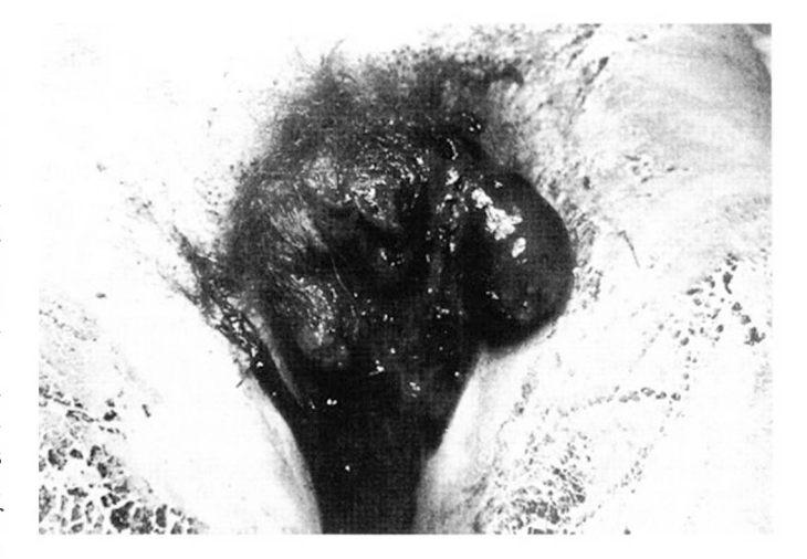
Fig. 1. The wound covered with blood clots.

He informed us that he had been hospitalized twice in a psychiatric hospital for depression. At physical examination, total amputation of the penis, both testicles and all the skin from the scrotum was noted. The wound was covered with blood clots (fig. 1). The genitalia were perfused and placed in Collins' solution at a temperature of 4°C. Under general anesthesia the wound was cleaned, and a median lower incision was made to open the urinary bladder. A U-shaped