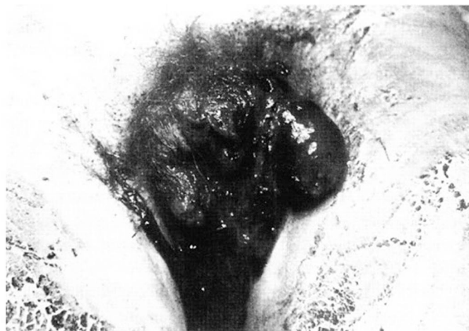
Fig. 1. The wound covered with blood clots.

polyethylene drain was inserted. One of its endings was brought out through the urethra stump. The amputated penis was then anastomosed in a first step with a semicircular suture of the urethra and next with a continuous suture of the corpora cavernosa. The ending of the U drain protruded through the external opening of the urethra. Under the operating microscope (Opton, Germany) the deep dorsal veins and dorsal arteries of the penis were anastomosed end to end, using Prolene 8-0 sutures. The dorsal veins were anastomosed in the same way. After identifying the arteries and veins, the spermatic